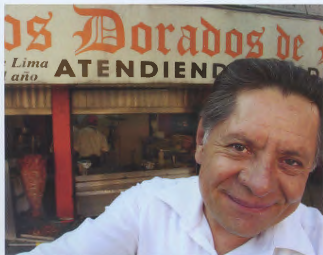
The proud proprietor in front of his restaurant's open grill